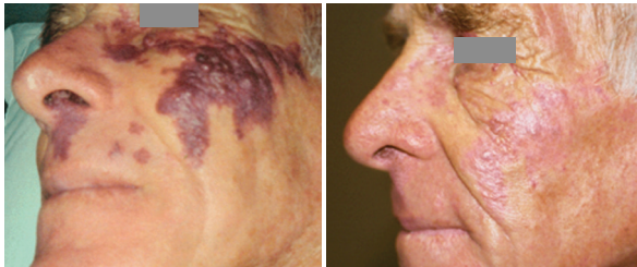
Baseline Post 1 Treatment

All photos are unretouched. Individual results may vary.