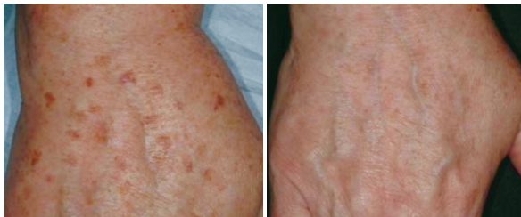
Baseline Post 1 Treatment

All photos are unretouched. Individual results may vary.