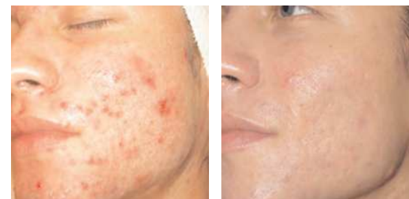
Before and After Photos of Cystic Acne Condition